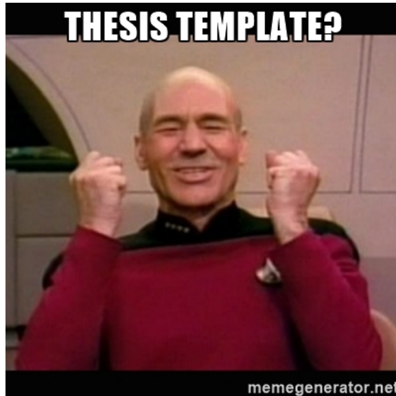
Figure 1.1: Glad to have a thesis class